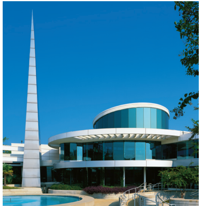
Hunter Henry Center at Mississippi State University, Mississippi State, MS Architect: Foil Wyatt Architects & Planners, P.A., Jackson, MS Glazing Contractor: American Glass Company, Inc., Columbus, MS

Solvent-free powder coatings add the green element with high performance, durability and scratch resistance that meet the standards of AAMA 2604.